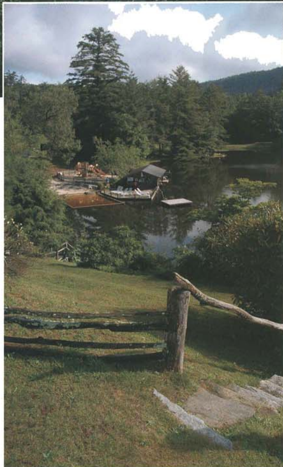
▲ The 1,400-acre property is filled with natural beauty and scenic views.