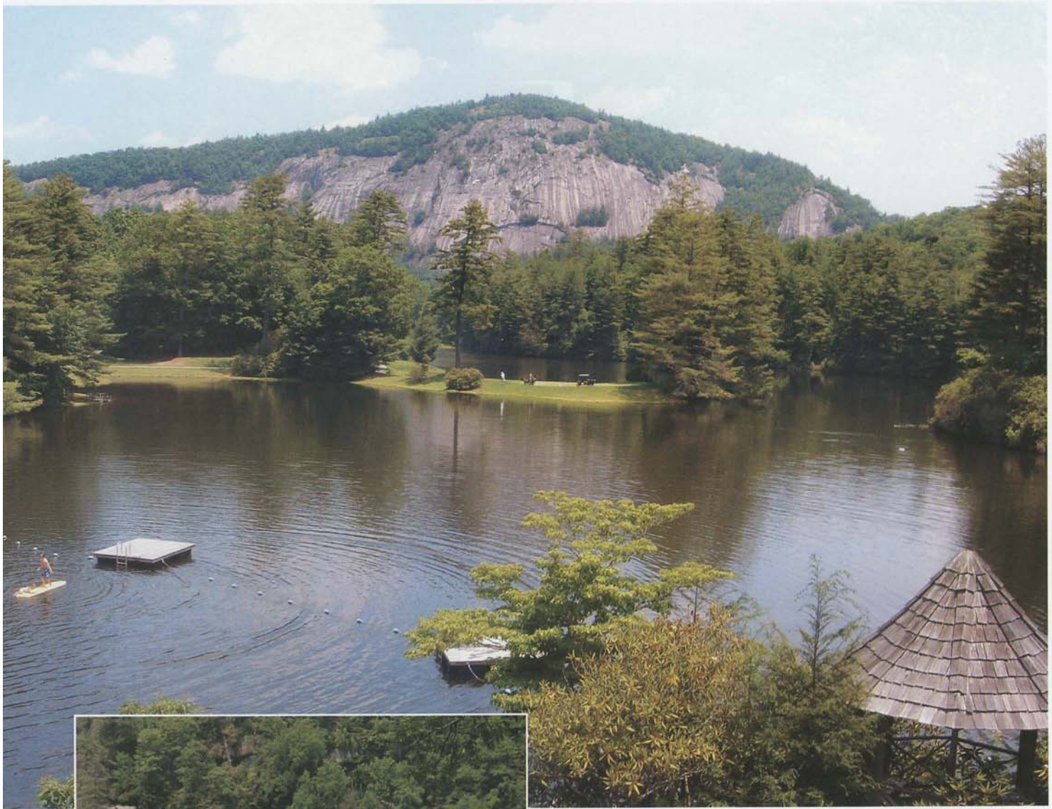
▲ The High Hampton's lake is ideal for fishing, boating and swimming.