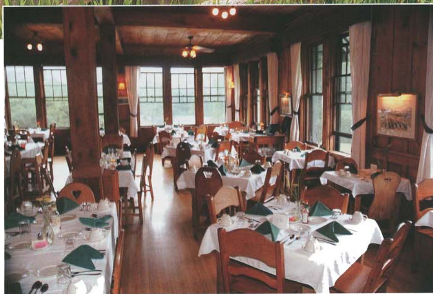
▲ The Inn's dining room serves tasty, home-style meals that are included in their Full American Plan rates.

To us, in addition to the comfortable accommodations, one of the most enjoyable elements of the resort is its breakfast, lunch and dinner buffets that feature homemade soups and breads, fresh salads, American country-style